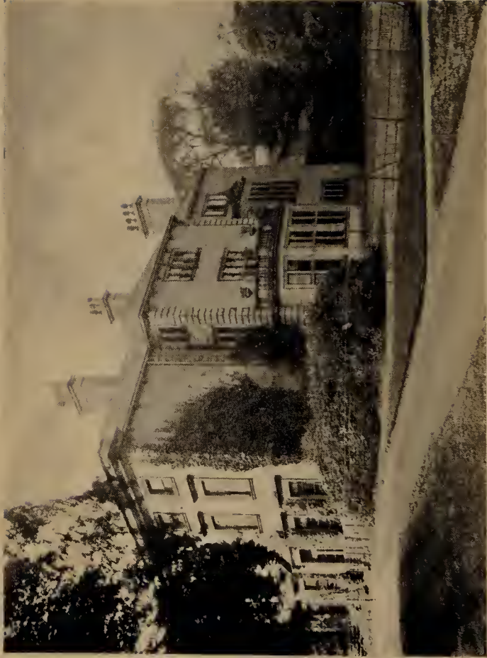
"HORTON LODGE," Blake Hall, Mirfield.